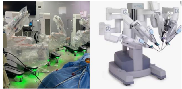
Figure 5: Modular nature of the HUGO RAS™ with individual arm carts versus the Da Vinci surgical system with arms arising from a single platform.

The operating surgeon using 3D eyewear, was able to maintain an ergonomic, erect posture without the need to bend into the console like in the closed console design which though immersive, at times can feel restrictive. The open console also allowed for observers to visualize the nuances of the procedure without the need for a separate surgeon console. The open console design also reduces adaptation time as the operating surgeon's vision is panoramic and unrestricted with increased situational awareness.