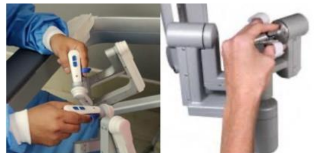
Figure 6: The trigger like grip of the operating rig offers better ergonomics in compared to the traditional pincer like handles offered.