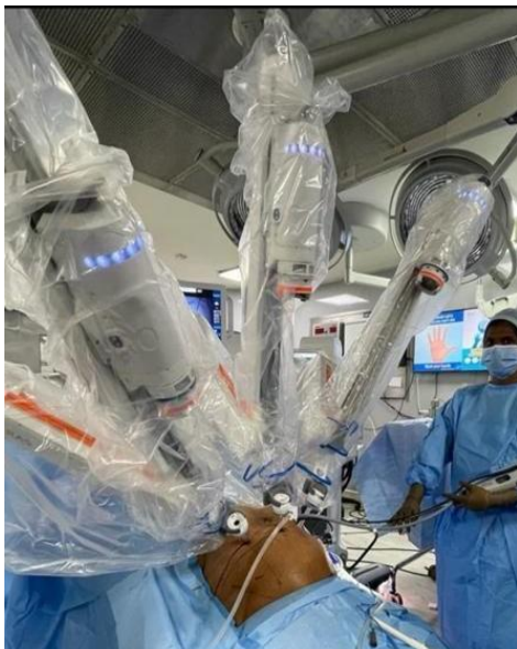
Figure 2: Hugo™ RAS docking with patient in trendelenberg and positioned with legs split apart.