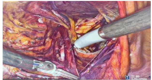
Figure 3: Dissection of cord structures using the wristed instruments.