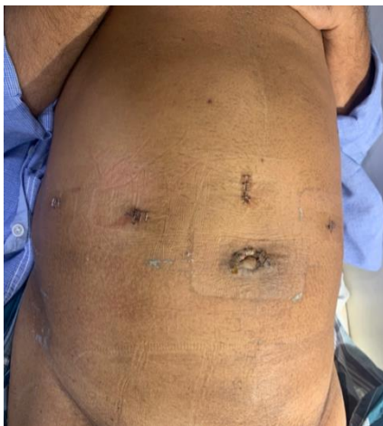
Figure 1: Port positions for bilateral rTAPP.

The peritoneum was closed with a running of 2' 0 barbed suture from lateral to medial avoiding any contact of the mesh with the bowel loops. The trocars were removed under vision and patient was extubated. Post-operative period was uneventful and patient was discharged on the first post-operative day. Patient was followed up to a period of 3 months and reported no recurrence or any other adverse event.