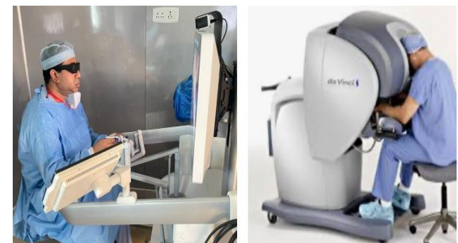
Figure 7: The Hugo™ RAS open design surgeon console versus the immersive console in the Da Vinci robotic assistant.