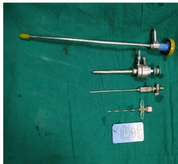
Figure 1: Instruments (Below to upwards). Proline 2-0, 18G-Touhy needle, Veress needle, 5 mm laparoscopic trocar and 5 mm laparoscopic camera.

Group B: Conventional open herniotomy performed.