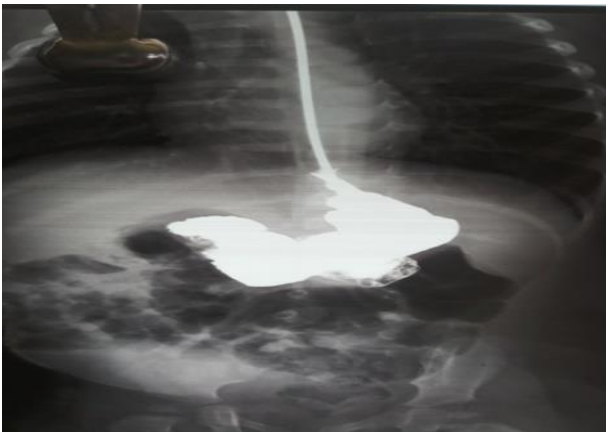
Figure 2: Contrast study at 3 months follow up.