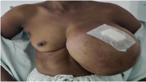
Figure 1: Preoperative image of left breast with lump.

histopathology was reported as benign lipoma of left breast. Patient was followed up after three months postoperatively without fresh complaints, having resumed her routine work.