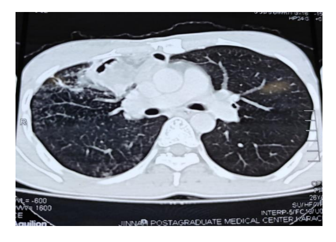
Figure 2: Computed tomography showing lesion in right upper lobe with heterogeneous intracavitary mass.