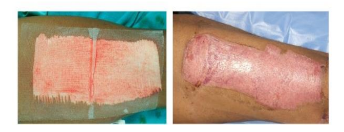
Figure 5: Cellulose acetate mesh on 14th post op day.

Harvest of split-thickness skin graft causes damage in epidermal and dermal layers of skin at the donor site. The management of the donor site after harvesting a splitthickness skin graft is an important issue, as patients often report more discomfort at the donor site than at the recipient site. Dressings are a mainstay for wound management. Our study reported the average time for appearance of healthy granulation tissue over the wounds that were treated with collagen dressing was nine days. Collagen, a major structural protein has been recommended by researchers for their active role in natural healing process and our study also showed that collagen dressings are better as compared to others.