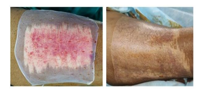
Figure 4: Collagen dressing on 10<sup>th</sup> post op day.

In a study by Ayaz et al conducted to evaluate effectiveness of collagen dressing in comparison to vaseline gauze dressing in healing of SSG donor site wound and to assess the rate of epithelialization, pain, pruritus, type and duration of need of analgesics.8 The comparison found that rate of epithelialization was faster with collagen as compared to vaseline gauze for donor site wound. There was also significant reduction in pain and pruritus in patients with collagen dressing along with considerable reduction in the need and duration of analgesics with collagen dressing. Usually, synthesis of collagen is mainly by fibroblasts which helps in cementing and acts as a plastic material in the process of wound healing. Amongst the other types of wound dressings or materials; Biological dressings such as collagen provide the most physiological interface between the environment and wound surface and is impermeable to bacteria. Also, for application of collagen dressing and its post application management no specific skill is required<sup>9</sup>. In a similar study, the study group proved that collagen dressing had lesser pain in comparison to control group.<sup>10,11</sup>