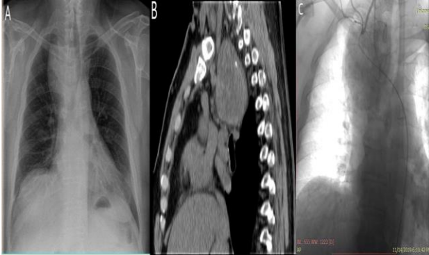
Figure 1: (A) C X-ray showing the right posterior mediastinal mass causing tracheal displacement, (B) CT scan confirming the extend and location of the mass and (C) selective catheterization of the brachiocephalic artery, showing aberrant artery arising from the thyrocervical trunk at the level of RIMA close to the origin of the vertebral artery.

encapsulated mass was found in the right posterior apex overlying the trachea in the mid-part, with the oesophagus on the back, inferiorly the margins of the azygos vein, anteriorly the superior vena cava and superiorly the anonymous artery (brachiocephalic trunk) and right subclavian artery.