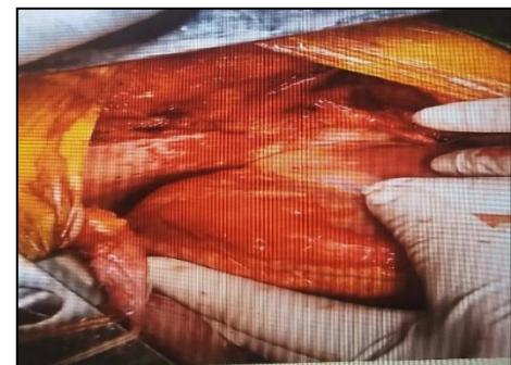
Figure 5: Hemorrhagic areas in the left circumflex territory.