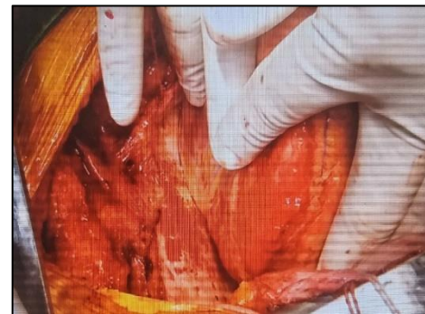
Figure 4: Features of ACS in the left circumflex artery territory.