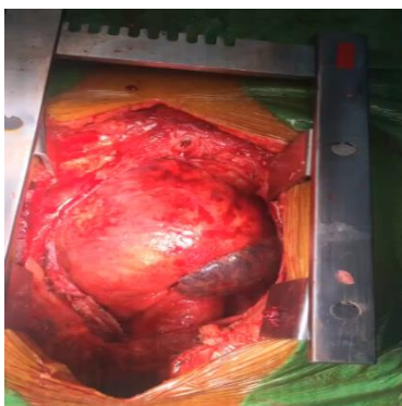
Figure 2: Extensive hemorrhagic, friable and edematous myocardium on opening.

This is much higher than the patients undergoing elective CABG where the re-exploration rates is usually minimal for post-operative bleeding. 6 patients (10%) required an IABP to be inserted before shifting them to the operation theatre. Another 6 patients (10%) needed an IABP to be put intra-operatively. 6 patients (10%) required dialysis, 9 patients (15%) developed arrhythmias in the post-operative period and responded well to medication. 12 patients (21%) required mechanical ventilation of more than 24 hours duration. Mortality was 5% in this sample size. Death occurred due to multi-organ failure and intractable low cardiac output states in all the three patients.