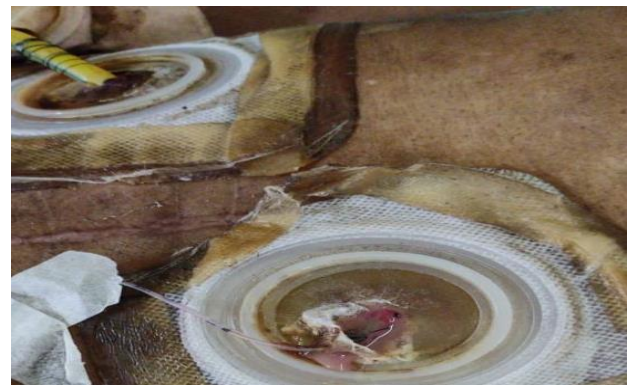
Figure 2: Prolonged discharge from drain site.

One patient among the 2 patients in the awaited group had complaint of prolonged pancreatic discharge for more than 5 and half months as a complication (Figure 2 below). Prolonged pancreatic discharge subsided on its own without any active intervention.