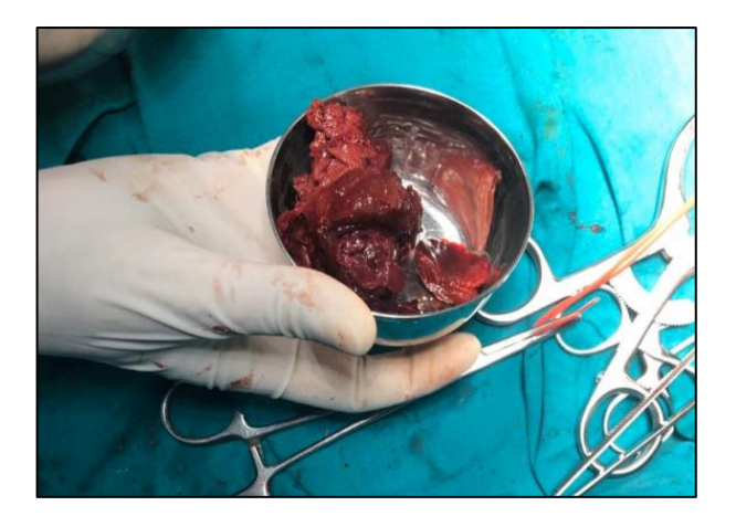
Figure 3: Excised giant thrombus from femoral artery aneurysm.