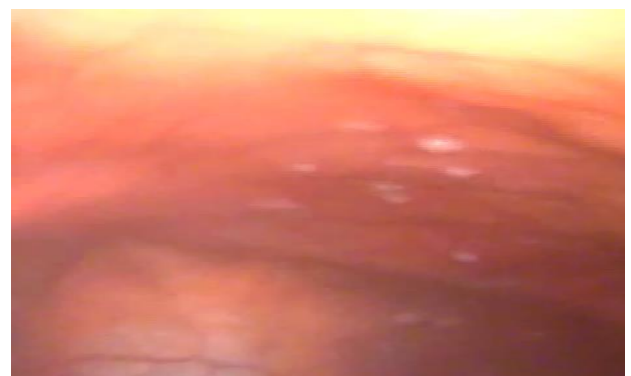
Figure 2: Peritoneal deposits not detected by CT.