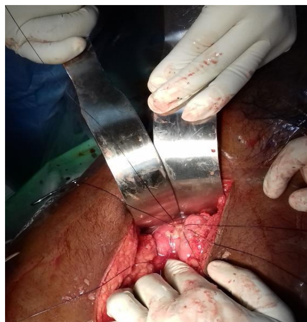
Figure 2: Closed duodenal perforation with Graham's omental patch. 9

Immediate resuscitation was done with naso gastric suction, intravenous fluids, antibiotics and urine output monitoring.