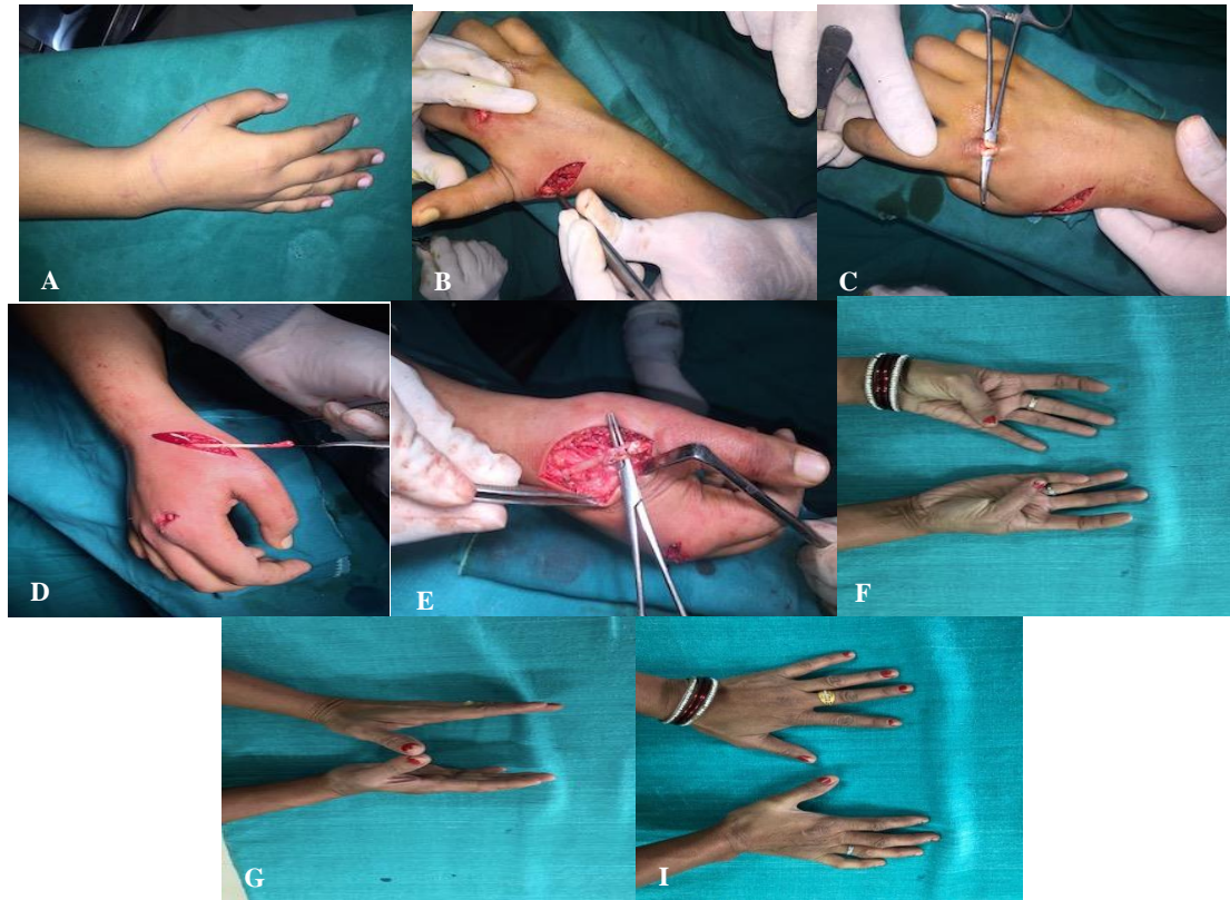
Figure 2: (A and B): Another small transverse incision was made at the level of wrist below the thumb. Transected EPL tendon is identified. (C) Small transverse incision was made just below the MP joint of the index finger. EIP tendon located on the ulnar side was identified, isolated and cut. (D) The cut EIP tendon is retrieved through this incision by subcutaneous tunneling. (E) The EIP tendon was sutured to the distal stump of EPL tendon using pulvertaft weaving technique with Ethilon 3.0. (G, H and I) 2i post op image of the patient, after 6 weeks patient is able to elevate the right thumb above the plane of palm.