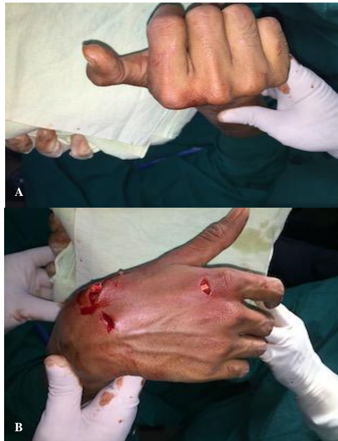
Figure 1: (A) Tension setting is done such that when the wrist is extended, thumb IP joint is flexed, (B) thumb is extended when the wrist is flexed.

A male patient aged 40 yrs, presented presented with inability to extend the right thumb above the plane of palm, patient was treated with nailing for fracture of distal end of radius four weeks back. She was treated with EIP to EPL tendon transfer.