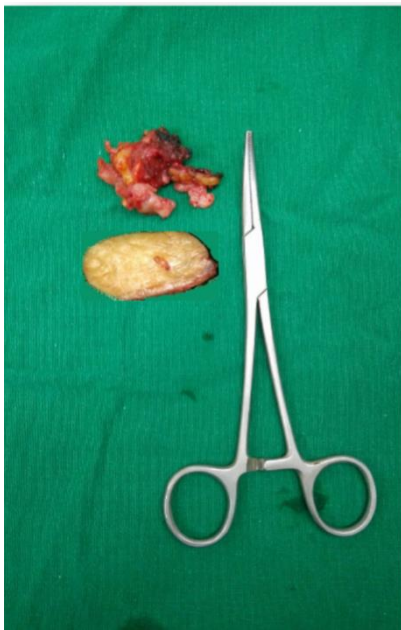
Figure 1: Excised specimen of the swelling.

Following which patient was taken up for wide local excisional biopsy.