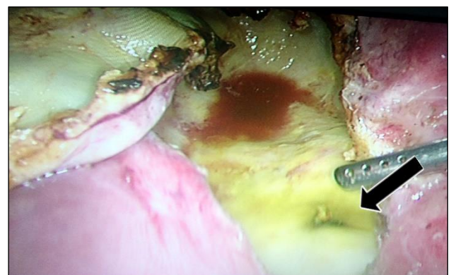
Figure 3: Cysto-biliary communication (arrow) in a hydatid cyst of liver with bile stained fluid.

Intraoperatively, Gall bladder was seen adherent to the cyst in 6 cases. All these patients underwent incidental cholecystectomy. Bile stained content was seen in 2 cases. Hypertonic saline was used in all cases for disinfection. Cysto biliary communication (Figure 3) was identified in 3 patients, all in laparoscopy and a primary closure was done.