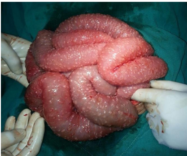
Figure 1: Intra operative image showing typical intestinal miliary lesions characteristic of tuberculosis in a case of SAIO.

Overall peritoneal tuberculosis was most common, seen in 40% cases which include, ascitis (22.5%), adhesions (15%) and omental tuberculosis (2.5%), followed by ulcersclerotic gastro intestinal tuberculosis in 32.5% cases, hyperplastic gastro intestinal tuberculosis in 27.5%. Ileocecal region was the most common site of involvement with 57.5% occurrence.