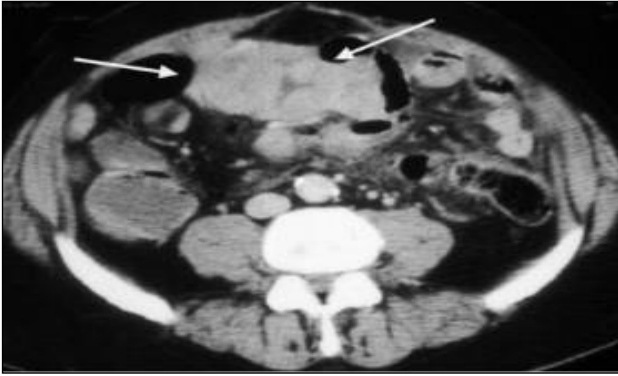
Figure 1: CECT of whole abdomen.

growth near DJ flexure and chances of leak were high. The patient had an uneventful postoperative course and doing well after 1 year of follow up with no recurrence.