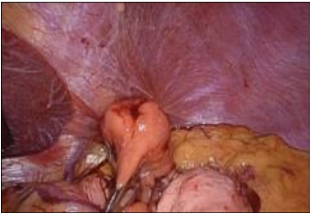
Figure 2: Intraoperative picture of jejunal tumour mass.