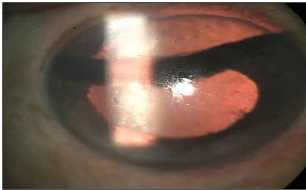
Figure 2: Retroillumination photo confirming the iridodialysis and subluxated cataract.

Anterior segment examination in the right eye was suggestive of clear cornea with irregular anterior chamber depth, pigment dispersion and vitreous strands in the pupillary area. There was a presence of large superior iridodialysis extending from 10'o clock to 2'o clock (Figure 1) along with inferiorly subluxated and anteriorly dislocated cataractous lens of grade 3 (Figure 2) with phacodonesis and zonular dialysis superiorly from 10'o clock to 2'o clock. The fundus examination in the right eye was suggestive of retinal pigment epithelium (RPE) alterations in the macular area. The intraocular pressure (IOP) was within normal limits. Hence a iridodialysis repair along with cataract extraction with IOL placement was planned in his right eye.