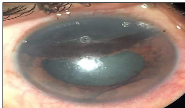
Figure 1: Slit lamp photo showing a large superior iridodialysis from 10 to 2'o clock position.

A 55-year-old male presented to us with a complaint of diminution of vision in the right eye following a blunt ocular trauma 3 months back. There were no relevant systemic complaints. No history of any past ocular surgery. Visual acuity in the right eye was counting fingers 1 meter and the left eye was 6/6. On examination left anterior segment and fundus were within normal limits.